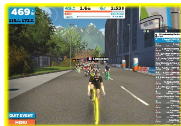
40+ riders entered the club champs